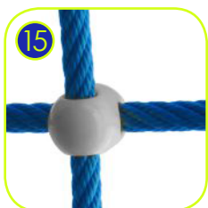
Solid and esthetic rope connectors made of injection molded polyamide.