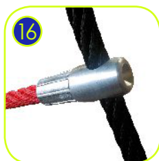
Rope endings pressed in a sleeve made of durable aluminum alloy.