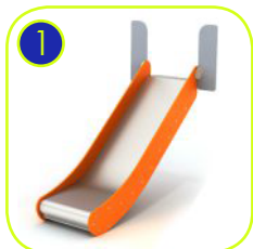
Slides made of stainless steel AISI 304. Metal sheet with a thickness of 2 mm formed in a CNC technique. Side panels made of HDPE polyethylene 15 mm, in the highest quality and totally damp-proof and resistant to UV.