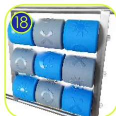
The TIC TAC TOE game is made of polyethylene rotationally molded with symbols on the form. Esthetic finishing without sharp edges. The barrel is 16 cm height and 15,5 cm wide enriched with additional symbols like sun and moon, making the fun even better.