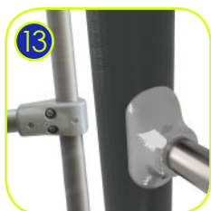
System of connectors and clamps made of strong aluminum alloy. Aluminum is secured by the process of electrophoresis and powder coating with polyester paint UV resistant and QUALICOAT attested.