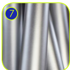
Solid construction made of stainless steel AISI 304 totally resistant to weather conditions.