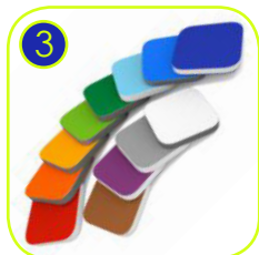
Plates of the walls made of colourful triple layered 15 mm HDPE polyethylene, in the highest quality, totally damp-proof and resistant to UV.