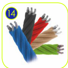
Polypropylene ropes pmmultisplit type with a steel core and a diameter of 16 mm.