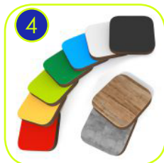
Plates of the walls and platforms made of colourful 13 mm HPL (black plates made of 8 mm HPL), in the highest quality, totally damp-proof and resistant to UV.