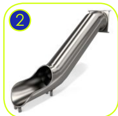
Tube slide made of stainless steel AISI 304. The metal sheet is 2 mm thick and the end section is finished with a band made of pipe 33,7 mm. The surface is polished.