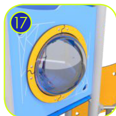
Hemispheric window with a diameter of 400 mm. Material: heat - formed polycarbonate 5 mm thick, resistant to vandalism.