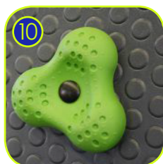
Climbing rocks made of chippings and colourful polyester resin.