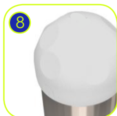
Safe pipe plugs made of injection molded polyamide.