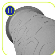
Tube made of LDPE polyethylene rotationally molded with the inner diameter of 53,3 cm and the length of 125 cm.