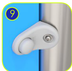
Plate and rope connectors made of injection molded polyamide.