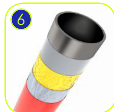
Solid construction made of black steel S235JR, cleaned in the sandblasting process. Protected against corrosion by galvanizing and powder coating with polyester paint QUALICOAT attested.