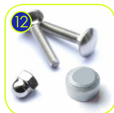
Connecting elements like screws, nuts, washers made of stainless steel. Vandal-proof screw plugs made of injection molded polyamide.