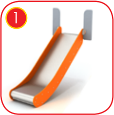
1 Slides made of stainless steel AISI 304. Metal sheet with a thickness of 2 mm formed in a CNC technique. Side panels made of HDPE polyethylene 15 mm, in the highest quality and totally damp-proof and resistant to UV.