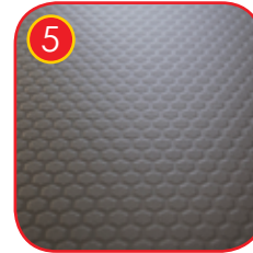
5 Anti-slip anthracite 10 mm HPL platform plate with a very high resistance to weather conditions and attrition.