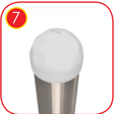
7 Safe pipe plugs made of injection molded polyamide.