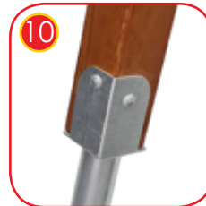
10 Wooden posts anchored to the ground with powder galvanized and powder coated steel anchors.