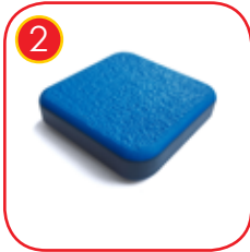
2 Plates of the walls made of colourful triple layered 15 mm HDPE polyethylene, in the highest quality, totally damp-proof and resistant to UV.