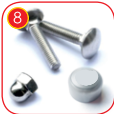
8 Connecting elements like screws, nuts, washers made of stainless steel. Vandal-proof screw plugs made of injection molded polyamide.