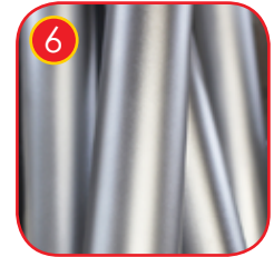
6 Solid construction made of stainless steel AISI 304 totally resistant to weather conditions.