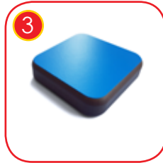
3 Plates of the walls and platforms made of colourful 13 mm HPL (black plates made of 8 mm HPL), in the highest quality, totally damp-proof and resistant to UV.