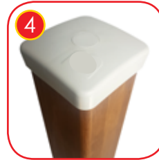
4 Safe post covers made of injection molded polyamide.