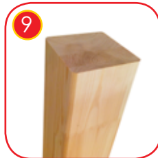
9 Soft conifer wood 90 x 90 mm, coreless, glued in layers with polyurethane glues, totally resistant to water. Wood posts processed in three-phased impregnation process.