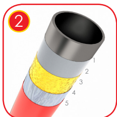
2 Solid construction made of black steel S235JR, cleaned in the sandblasting process. Protected against corrosion by galvanizing and powder coating with polyester paint QUALICOAT attested. 1 – steel, 2 – sandblasting, 3 – iron phosphatizing, 4 – zinc base, 5 – polyester powder paint.