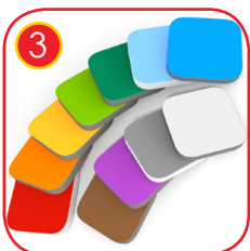
3 Plates of the walls made of colourful triple layered 15 mm HDPE polyethylene, in the highest quality, totally damp-proof and resistant to UV.