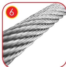
6 Rope with a diameter of 10 mm – made of braided galvanized steel wire.