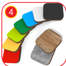
4 Plates of the walls made of colourful 13 mm HPL (black plates made of 8 mm HPL), in the highest quality, totally damp-proof and resistant to UV.