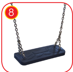
8 The seats are made with an aluminum construction covered with a soft EPDM rubber, hanged on 6mm stainless steel chains.