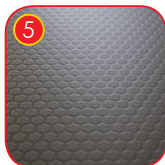
5 Anti-slip anthracite 10 mm HPL platform plate with a very high resistance to weather conditions and attrition.