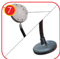
7 Stainless steel trolley equipped in a brake to prevent it from moving without a user. Seat made of soft rubber, reinforced with a steel sheet. Hanged on a galvanised chain covered in a rubber sleeve.