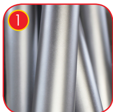
1 Solid construction made of stainless steel AISI 304 totally resistant to weather conditions.