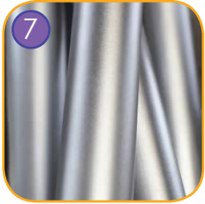
Solid construction made of stainless steel AISI 304 totally resistant to weather conditions.