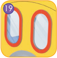
The windows are made of safe polycarbonate 8 mm thick.