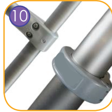
System of connectors and clamps made of strong aluminum alloy. Aluminum is secured by the process of electrophoresis and powder coating with polyester paint UV resistant and QUALICOAT attested.