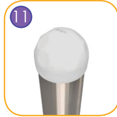
Safe pipe plugs made of injection molded polyamide.