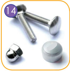
Connecting elements like screws, nuts, washers made of stainless steel. Vandal-proof screw plugs made of injection molded polyamide.