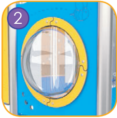
Hemispheric window with a diameter of 400 mm. Material: heat-formed polycarbonate 5 mm thick, resistant to vandalism.