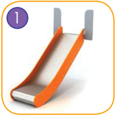
Slides made of stainless steel AISI 304. Metal sheet with a thickness of 2 mm formed in a CNC technique. Side panels made of HDPE polyethylene 15 mm, in the highest quality and totally damp-proof and resistant to UV.