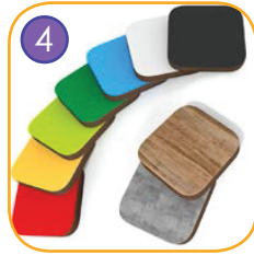
Plates of the walls and platforms made of colourful 13 mm HPL (black plates made of 8 mm HPL), in the highest quality, totally damp-proof and resistant to UV.