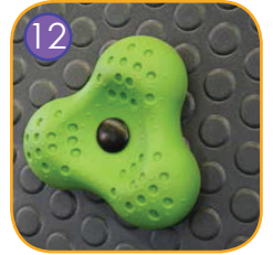
Climbing rocks made of chip-pings and colourful polyester resin.