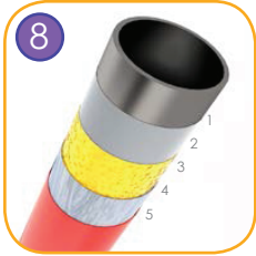
Solid construction made of black steel S235JR, cleaned in the sandblasting process. Protected against corrosion by galvanizing and powder coating with polyester paint QUALICOAT attested. 1 - steel, 2 - sandblasting, 3 - iron phosphatizing, 4 - zinc base, 5 - polyester powder paint.