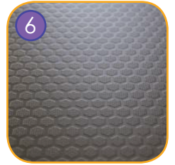
Anti-slip anthracite 10 mm HPL platform plate with a very high resistance to weather conditions and attrition.