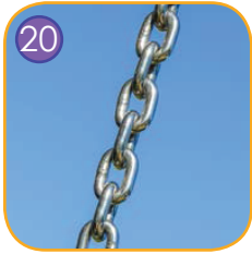
Attested 6 mm stainless steel chains.