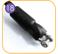
Ends of ropes clamped in sleeves made of durable aluminum alloys.