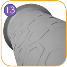
Tube made of LDPE polyethylene rotationally molded with the inner diameter of 53,3 cm and the length of 125 cm.