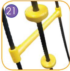
Rope ladder steps and rope knots made of injection molded polyamide.