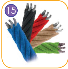
Polypropylene ropes pp-multi-split type with a steel core and a diameter of 16 mm.