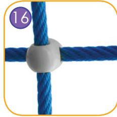
Solid and esthetic rope connectors made of injection molded polyamide.