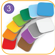
Plates of the walls made of colourful triple layered 15 mm HDPE polyethylene, in the highest quality, totally damp-proof and resistant to UV.