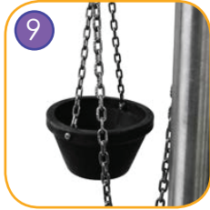
Sand bucket made of soft rubber. The lift and the chain are made of stainless steel.