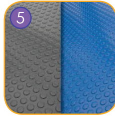
Anti-slip 18 mm HDPE plate. Very high resistance to weather conditions and attrition.