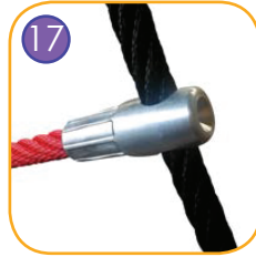
Rope endings pressed in a sleeve made of durable aluminum alloy.