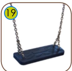
19 The seats are made of aluminum construction covered with a soft EPDM rubber, hanged on 6mm stainless steel chains.