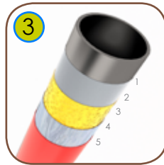
3 Solid construction made of black steel S235JR, cleaned in the sandblasting process. Protected against corrosion by galvanizing and powder coating with polyester paint QUALICOAT attested. 1 - steel, 2 - sandblasting, 3 - iron phosphatizing, 4 - zinc base, 5 - polyester powder paint.