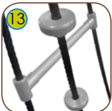
13 Rope ladder steps and rope knots made of injection molded polyamide.