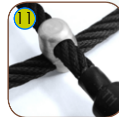
11 Cross connection of ropes clamped in sleeves made of durable aluminum alloys. Used in elements requiring extremely high strength.