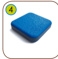
4 Plates of the walls made of colourful triple layered 15 mm HDPE polyethylene, in the highest quality, totally damp-proof and resistant to UV.