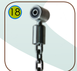
18 Swing slings, with double bearings, made of stainless steel guarantees a quiet mechanism operation. Beside the horizontal movement it also allows the circular movement to avoid a chain twisting.