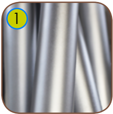
1 Solid construction made of stainless steel AISI 304 totally resistant to weather conditions.