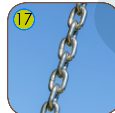
17 Attested 6 mm stainless steel chains.