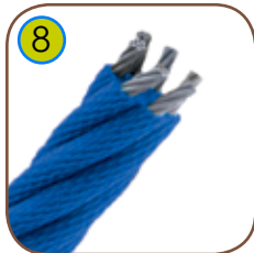
8 Polypropylene ropes pp-multi-split type with a steel core and a diameter of 16 mm.