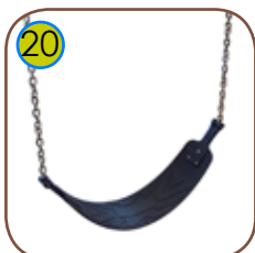
20 Flexible seat made of reinforced belt covered with soft rubber, hanged on 6 mm stainless steel chains.