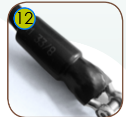
12 Ends of ropes clamped in sleeves made of durable aluminum alloys.