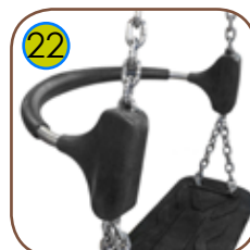
22 Back support of the seat with steel construction covered with soft polyurethane. Endings made of polyamide.