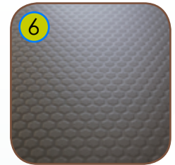
6 Anti-slip anthracite 10 mm HPL platform plate with a very high resistance to weather conditions and attrition.