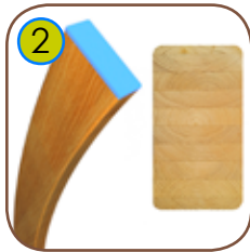
2 Bended posts made of soft conifer wood 9 cm thick, 26 cm wide and 280 cm long. The wood is glued in layers with polyurethane glues, totally resistant to water. Wood posts processed in three-phased impregnation process.