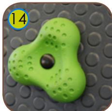
14 Climbing rocks made of chip-pings and colourful polyester resin.