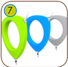
7 Ergonomically-shaped polyethylene rings improving the physical well-being and motor coordination.