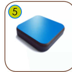
5 Plates of the walls and platforms made of colourful 13 mm HPL (black plates made of 8 mm HPL), in the highest quality, totally damp-proof and resistant to UV.