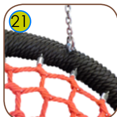
21 "Bird nest" type seat with a diameter of 100 cm, hanged on 6 mm stainless steel chains. Metal frame covered with soft polypropylene rope.