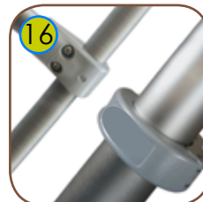
16 System of connectors and clamps made of strong aluminum alloy. Aluminum is secured by the process of electrophoresis and powder coating with polyester paint UV resistant and QUALICOAT attested.