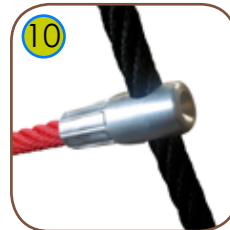
10 Rope endings pressed in a sleeve made of durable aluminum alloy.