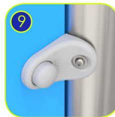
Plate and rope connectors made of injection molded polyamide.

Safe pipe plugs made of injection molded polyamide.